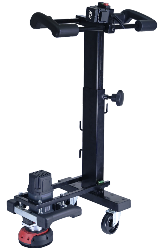
6 Floor Grinding Trolley