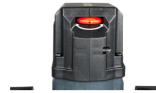
1 Variable speed for different applications