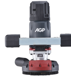
2 Anti-vibration mountings for maximum operator comfort