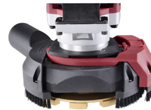
3 Tool-free sliding cover for edge grinding