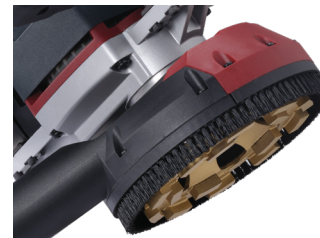
4 Replaceable brush bristles for smooth action and efficient dust containment