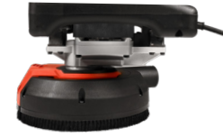
5 Effective dust control skirt with spring suspension